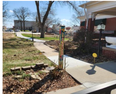
View after dead shrubs removed.