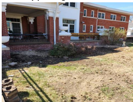
Front of Home ready for landscaping. View from the alley on north side.