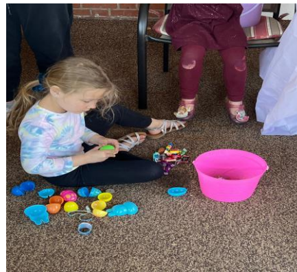
Friday, April 7, 2023 was a beautiful day for the Annual Easter Egg Hunt. Pictured are some of the Resident grandchildren, great grands, and children of staff members enjoying the day.